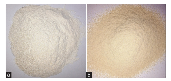
Fig. 1: (a) Egg whites powder with freeze-drying method. (b) Fermented soybean flour with oven method

This study used alloxan as a chemical induce to damage the pancreatic \beta -cells which are resulting in an elevation of blood glucose levels. The