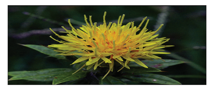
Fig. 1: The safflower (Carthamus tinctorius L.) plant

The results were referred that safflower oil had different five fatty acids including linolic acid (Lin) (56.37%), linolenic acid (L) (15.02%), stearic acid (S) (2.37%), oleic acid (O) (14.83%), and palmitic acid (P) (7.91%) as shown in Figs. 1-3.