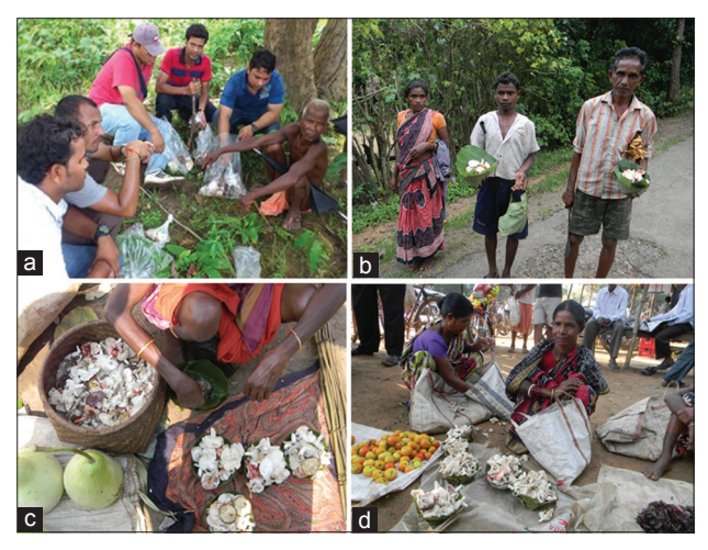
Fig. 3: Wild edible mushrooms of the study area: (a) Collecting wild mushrooms and interacting with old elderly person on its medicinal uses, (b) collection of wild edible mushrooms from forest by local tribal for food, (c and d) tribal women selling wild edible mushrooms in local market

forest products for their livelihood. However, in the present study it was revealed that most of the wild edible mushroom species sold by the tribal communities were less demanding and fetched very low price. This was probably due to perception of the people who always considered wild mushrooms to be poisonous. Besides, many people were found to be quite ignorance about their edibility. Documentation and dissemination of knowledge on wild edible mushrooms would help the tribal communities to fetch a higher price and increase income generation. Further details of nutritional analysis and scientific study on their medicinal properties would also help in market demand of