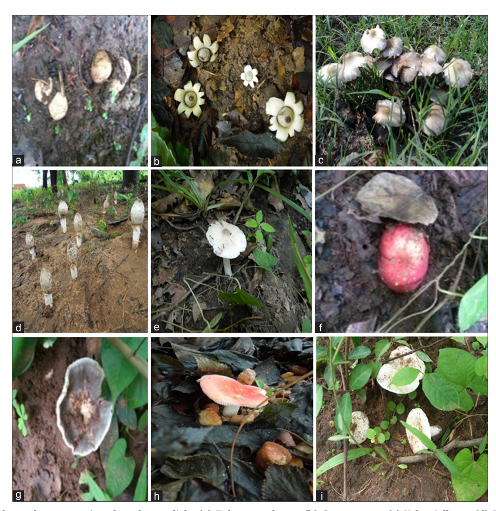
Fig. 2: Wild edible mushroom species of northern odisha (a) Tuber maculatum , (b) Geastrum sp., (c) Volvariella sp., (d) Termitomyces sp., (e) Termitomyces cartilaginous , (f) Russula emetic , (g), Russala virescens , (h) Russula rosea , (i) Russela sp.

and eaten by the tribal communities. Similarly, several workers have also reported wild edible mushrooms among ethnic tribes of India and around the world [5,26-28]. Wild edible mushrooms are known to have high nutritional value and are important sources of food supplement for tribal communities that live in consonance with nature and