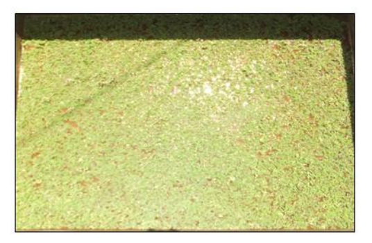
Fig. 1: Mass multiplied Azolla Species

Azolla is a free floating aquatic fern, which can be widely found in freshwater environments in temperate and tropical regions all over the world. It ranks among the fastest growing crops on earth and due to its association with the nitrogen fixing Cyanobacteria Anabaena azollae , it is independent of external organic nitrogen. In that way Azolla species is not only known to fix huge amounts of carbon, but as well to produce vast amounts of organic nitrogen. The nutrient, which mainly limits the growth of Azolla , is phosphorous. Azolla comes under the family of Salviniaceae [13].In the present study the procured strains of Azolla were mass multiplied under controlled condition (FIG 1) without Lemna species contamination. The dead Azolla cultures were removed periodically in order to enhance the oxygen content for a time. The well grown Azolla cultures have been treated with the selected paddy cultivars for 21 days.