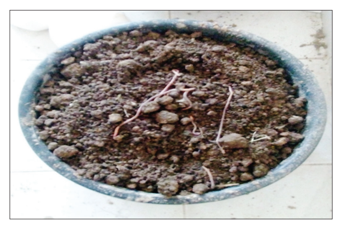
Fig. 1: The accumulated and adopted to the artificial soil bed

For the filter paper contact method, the toxicity is expressed basically in \mu g/cm<sup>2</sup>. Based on the resulting 48-h LC50 values lethal dose [28,29], the urea fertilizer will be classified as super toxic element (<1.0 \mu g/cm<sup>2</sup>), extremely toxic at 1–10 \mu g/cm<sup>2</sup>, very toxic at 10–100 \mu g/cm<sup>2</sup>, moderately toxic at 100–1000 \mu g/cm<sup>2</sup>, or relatively non-toxic at >1000 \mu g/cm<sup>2</sup>. Moreover, the lethal time duration for the individual earthworms per the 5 ml solution testing is determined and is graphically represented (Graph 1).