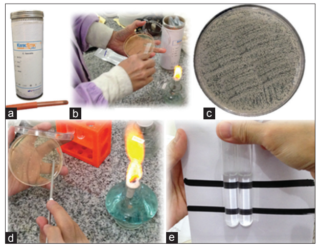
Fig. 1: (a) Enterococcus faecalis American Type Culture Collection (ATCC) 29212<sup>™</sup> bacterial preparations, (b) culturing of E. faecalis ATCC 29212<sup>™</sup> on brain heart infusion agar, (c) colonies of bacteria formed after incubation at 37°C for 24 h, (d) collection of bacterial colonies using ose needles to be inserted in a reaction tube containing NaCl, (e) density adjustment according to McFarland standard 0.5

Further, the sample was homogenized using a vortex machine for 10 s and centrifuged at 12,000 rpm for 3 min until the sample solution separated into natant and supernatant. The supernatant was transferred into a new microcentrifuge tube and kept at 4°C for 24 h. When in microcentrifuge tubes, natant deposits were still visible, but the supernatant was transferred again into a new microcentrifuge tube and stored at -20^{\circ} C.