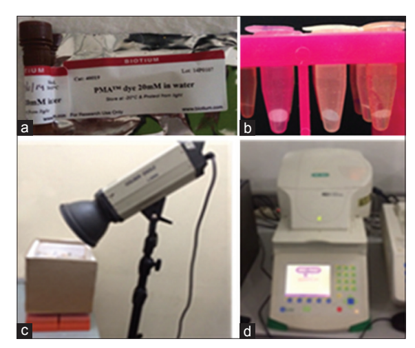
Fig. 3: (a and b) Addition of propodium monoazide and incubation in dark room, (c) exposure to 600 watts of halogen rays for 20 min, (d) detection and quantification of DNA of Enterococcus faecalis using real-time polymerase chain reaction