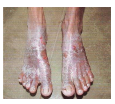
VICHARCHIKA BEFORE TREATMENT

(BT- before treatment, Second- 2^{\rm nd} week, at – After treatment, af2 – Follow up 2 nd week, af4- follow up 4 th week)