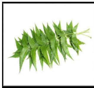
Fig. 2: Azadirachta indica