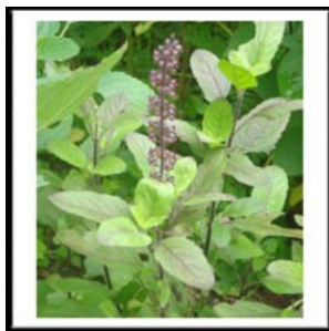
Fig. 1: Ocimum tenuiflorum

The present study was aimed to determine the potential antibacterial activities of extracts from eight selected medicinal plants organs belonging to different families on human pathogenic bacteria, in order to valorize them in the light of previous works for further application in food and pharmaceutical industries as natural valuable products (fig. 7)