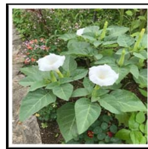
Fig. 3: Datura stramonium