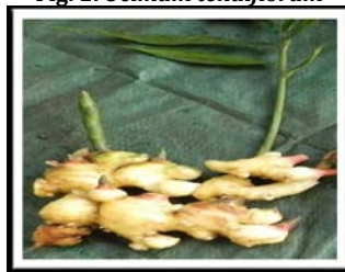
Fig. 4: Zingiber officinale