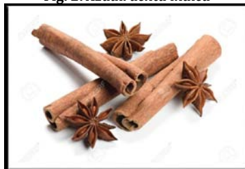
Fig. 5: Cinnamomum cassia