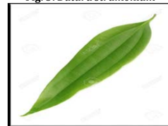
Fig. 6: Cinnamomum tamala