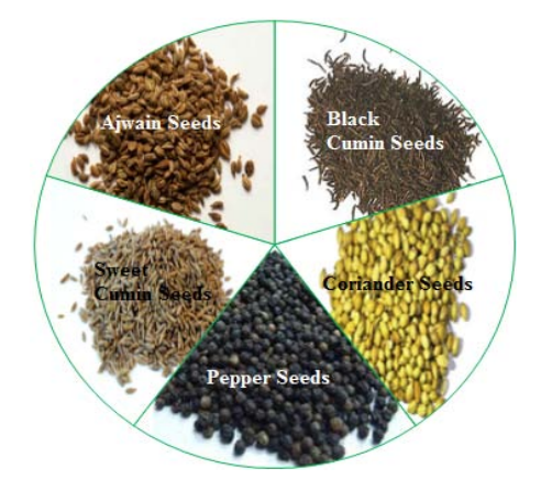
Fig. 1: Types of the investigated traditional Indian medicinal spice seeds of Ballari district, Karnataka, India

Sampling area of all the 5 medicinal spice plants, listed in table 1 with local name, scientific name, parts of plants and medicinal use, were collected from the fields of Ballari district, Karnataka is situated almost at the southern North Karnataka.