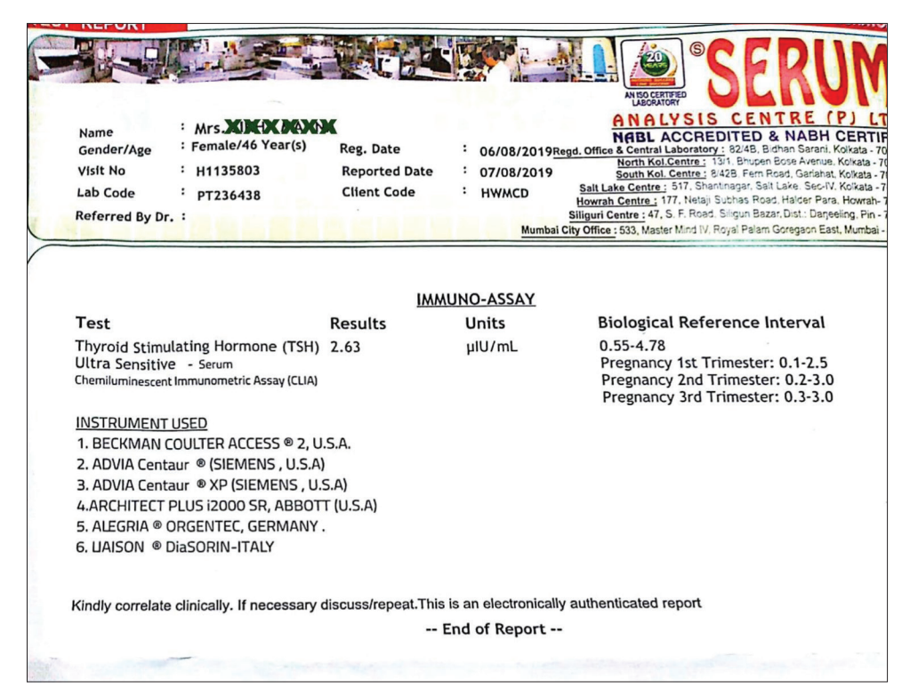
Fig. 2: Examination of TSH (after treatment)