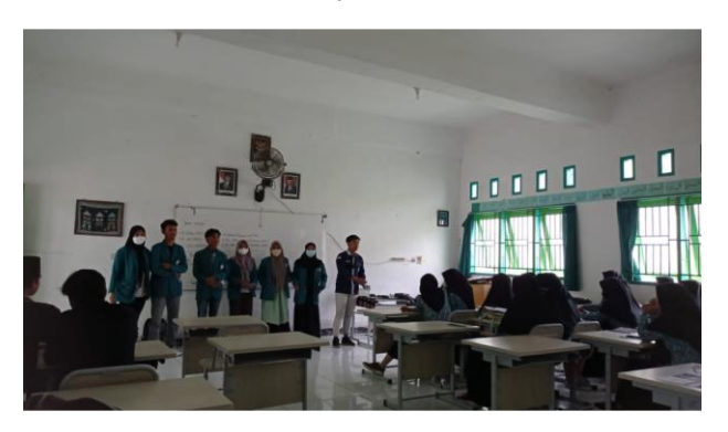
Figure 2 Process of Submission of Information by Student Representatives of Mataram State Islamic University