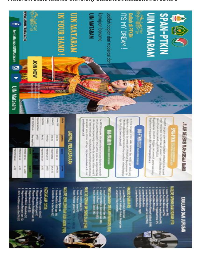
Figure 1 Mataram State Islamic University Student Socialization Brochure

Implementation stage . The stage of implementing the socialization activity is divided into two stages, namely Submission of material and Discussion / Questions and Answers. The first stage is the delivery of socialization materials by representatives of students receiving Smart Indonesia Card scholarships from the Mataram State Islamic University. There are several topics of material presented, including: