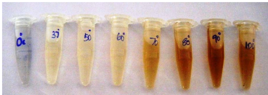
Fig. 1: Insets photographs showing colour variations after different reaction time intervals

The SEM micrograph provided further information about the morphological characteristics of the particles synthesized. It was confirmed that the particles were spherical in shape. The scanning electron micrograph of the nanoparticles at 28-31 nm is shown in the fig. 3.