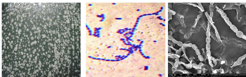
Fig. 1: Colony morphology, Spore chain and surface ornamentation of GOS2

The isolate was identified and confirmed as Streptomyces sp., as per the identification criteria in Bergey's manual of Determinative bacteriology, Systematic bacteriology and the International Streptomyces Project guidelines [7-9]. The microscopic studies revealed a rectus spore chain arrangement and the electron microscopic studies revealed the spore surface ornamentation to be smooth (fig. 1).