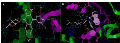
Fig. 1: (a)Etoposide showing hydrogen bonding interactions in the active site of DNA topoisomerase II, (b) Compound 12c in the active site of Topoisomerase II.