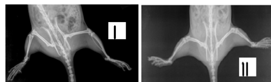
Control Std- Methotrexate