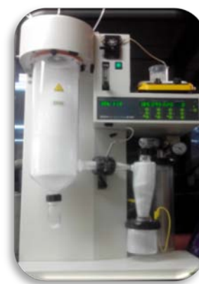
Fig. 1: Microencapsulation process by a spray dryer

The spray drying technique is based on the entrapment of the essential oil compounds on a solid matrix of starches to reduce their mobility. Fig. 1 shows the microencapsulation process of the mango pulp.