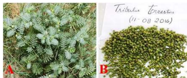
Fig. 1: Showing (A) plant of Tribulus terrestris (B) fruit of Tribulus terrestris

The extractive value of TT was found to be 6.9% (w/w).