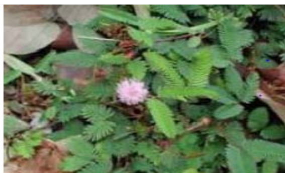
Fig. 1: Mimosa pudica [5]

M. pudica grows in all types of soil; it can survive in soil with low nutrient concentration. It usually requires disturbed soil to establish itself. Frequent burning may encourage its spread in pastures. The plant does shade sensitive and does not grow under forest canopies. Carbon disulfide is produced by the root which discerning inhibit colonization of the rhizosphere by mycorrhizal and pathogenic fungi. This plant grows by the roadsides or area disturbed by constructions; it usually grows as a single plant or in tangled thickets. It also grows near sea level up to 1,300m in elevation with annual precipitations from about 1000 to 200 mm [12, 13].