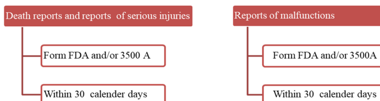
Fig. 3: Mandatory reporting requirements for importers [28]