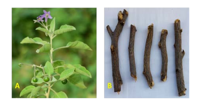
Fig. 1: A. Habit of S. pubescens , the source of leaf material, B. The stem with bark