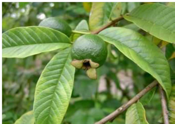
Fig. 1: Leaves and fruits of Psidium guajava

The aim of the present study is to compare the anti-diabetic activity of aqueous leaf extracts of Psidium guajava and Moringa oleifera and to investigate the anti-diabetic activity of the combined extract of both the plants. The objective of the study is to perform the Glucose diffusion inhibition method and alpha amylase inhibitory assay of the plants under study individually and as well as a combination of aqueous extracts of both the plants.