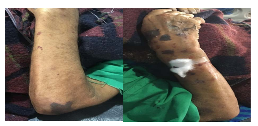
Fig. 2: Showed ecchymosis on both hands