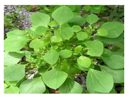
Fig. 1: Photograph of medicinal plant Acalypha indica Linn.

study was aimed to investigate acute and sub-chronic toxicity studies of methanolic stem extract of A. indica.