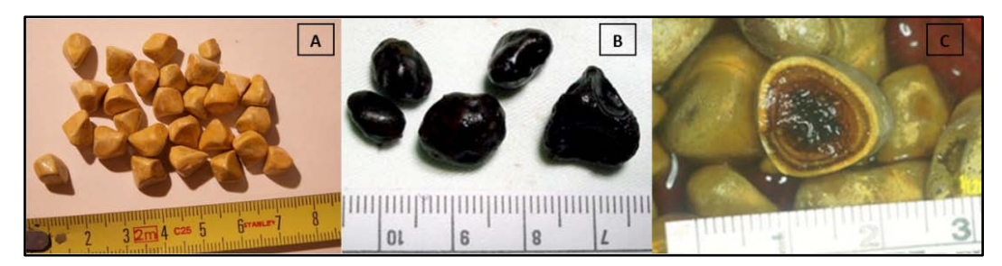
Fig. 1: (A) Cholesterol, (B) pigmented and (C) mixed stones