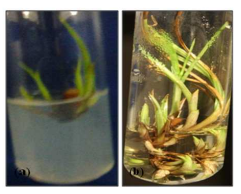
Fig. 2: (a) Multiple shoot induction from rhizome explants on media containing 3.0 mg/l 2,4-D+0.5 mg/l Kn. (b) Multiple shoot induction in liquid media containing 3.0 mg/l 2,4-D+3.0 mg/l NAA+0.5 mg/l Kn after three weeks of inoculation

D with Kn. When medium supplemented with 3.0 mg/l 2,4-D 74.3 % shoot inductions was observed. 62.5 % shoot induction were noticed on medium supplemented with 4.0 mg/l 2,4-D combination with Kn. Among these tested concentrations of Kn combination with 2,4-D higher multiple shoots were noticed on medium containing 3.0 mg/l 2,4-D with 0.5 mg/l Kn with average number of shoots were 4.16±0.16 with shoot length 2.79±0.18 (Fig.2(a)).