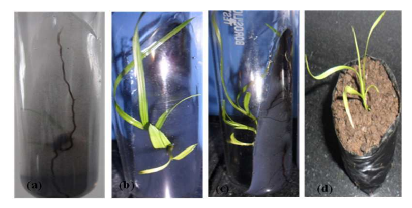
Fig. 3: (a) Initiation of roots from excised shoots cultured in vitro solid MS medium supplemented with 1.0 mg/l IBA+500 mg/l activated charcoal. (b&c) Elongation of shoots and roots after four weeks in rooting media containing 1.0 mg/l IBA with charcoal. (d) Successful pot culture of in vitro grown plantlet Cyperus rotundus L

Values are expressed as mean \pm SE (n=10 in replicate). Mean followed by same letters do not differ significantly at p \ge 0.05 by Tukey's HSD test.