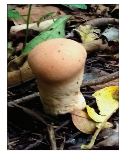
Fig. 1: Lycoperdon pyriforme (Apioperdon pyriforme)

GC-MS analysis of chloroform extract of L. pyriforme showed the presence of 33 different compounds. The active compounds with their retention time, area, area percentage, height, height percentage, base m/z, and their names are presented in Table 1. The GC-MS chromatogram of the chloroform extract is shown in Fig. 2. About 33 compounds have been found in which 1-Heneicosanol (11.17%) and E-15-Heptadecenal (11.08%) are the major compounds and Dichloroacetic acid, decyl ester (0.15%), and 1-Tetradecanol (0.16%) formed minor compounds in the chloroform extract. Besides, a number of compounds such as E-14-Hexadecenal, Phenol, 2,4-bis(1,1-Dimethylethyl)-, n-Tetracosanol-1, Ergosterol, Ergosta-7,22-Dien-3-ol, and (3.Beta.,22E)- are also present in fairly large amounts which gives Lycoperdon sp. its antibacterial