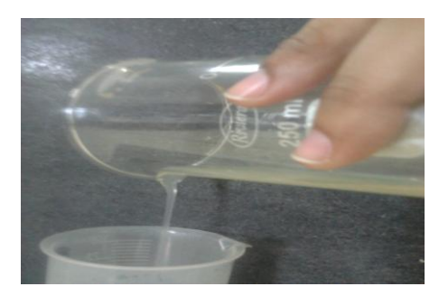
Fig. 1: Ascorbic acid loaded hydrogel formulation

An amber coloured, translucent, viscous hydrogel was formed from starch and gelatin which can be seen in Figure 1. It is enriched with ascorbic acid and Aloe vera gel powder as the drug carrier. The gel was cross-linked properly on the addition of 1 ml of aqueous solution of PVP which provided the framework.