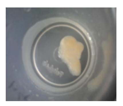
Figure 5: Swelling of hydrogel implies the release of drug through diffusion

Swelling is the most important property of the hydrogel. This is possible since the polymers swell without dissolving in an aqueous biological environment. At equilibrium, the gels comprise 60-90 % fluid and only 10-30 % polymer. The hydrogels swell in water and the space between polymer chains becomes large as can be seen in Figure 5.