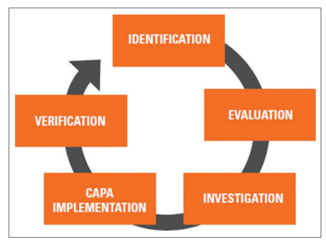
Fig. 2: Implement a corrective and preventive action system with a closed loop