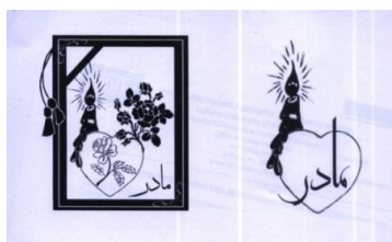
Fig.2. Representation of women in Iranian death notices

In Iranian culture, death notices including deceased's photo are utilized to report recent death of a person and provide some more information concerning upcoming funerals, relatives' names and a brief poem to show relatives' grief on such a loss. However, providing no image of women in such notices elucidates the Iranian hidden ideology of showing respect towards women not only in real life situations- when they are alive, but also such attitude is kept after their death. It is believed that females are not objects to be advertised, while they are respected treasures of kindness, generosity, love, and benevolence. Images of a red rose or a candle-as symbols of their kindness, generosity, and love are used in such cases as it is represented in Figure 2. Some poems are also written to show depth of such a grief on the loss of an amazing creature.